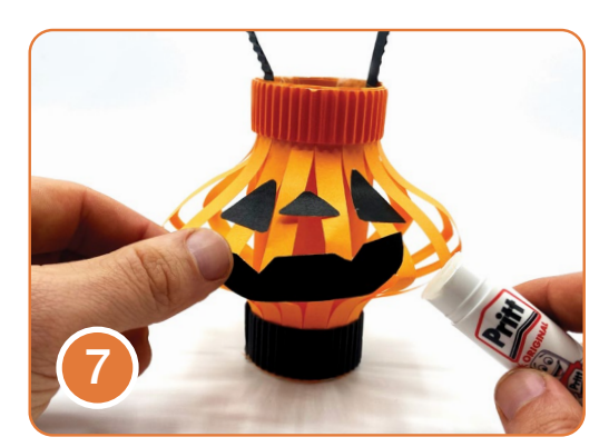
8. Glue your pumpkin face to your lantern.