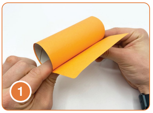
1. Cover cardboard roll with orange paper 2. Cut a second piece of paper the length by wrapping around and taping.