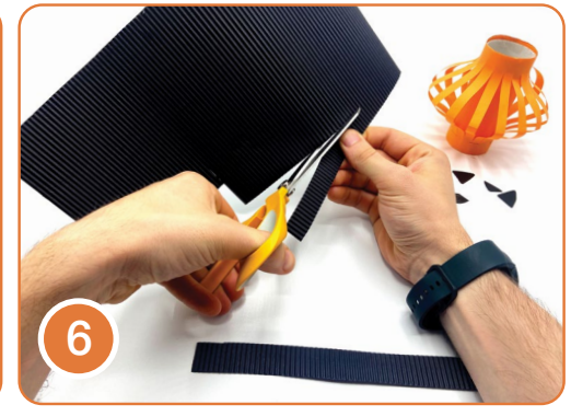
6. Cut out three strips of cardboard to wrap around the top and bottom of the lantern, as well as a strip as a handle. Attach using glue or tape.