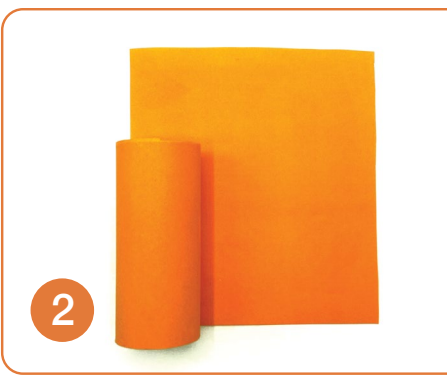
of the paper roll and about 1.5x times the height, as seen above.