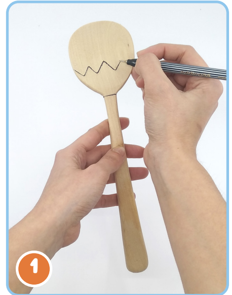
1. Start by drawing a zig-zag on the wooden spoon, front and back.