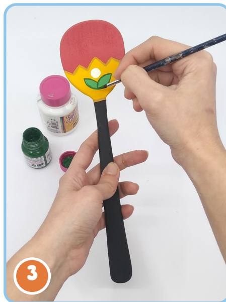
3. Gently outline the zig-zag with the darkest yellow paint. Then paint a small white circle and two green leaves in the centre of the yellow area. Finish your sceptre by outlining the leaves with dark green paint.

Then paint the handle of the wooden spoon in black. Leave aside to dry.