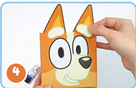
4. Cut and glue the ears on the top of the box. Then glue the eyebrows in front of the ears.