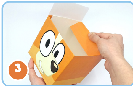
3. For a good finish, glue the excess of the template into the box.