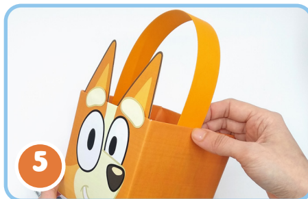
5. To finish, cut a dark orange paper strip and glue it into the sides of the box to create the basket handle.