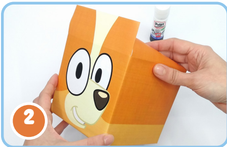
2. Place Bingo's face on the front of the box, then fold the rest of the template around the box.