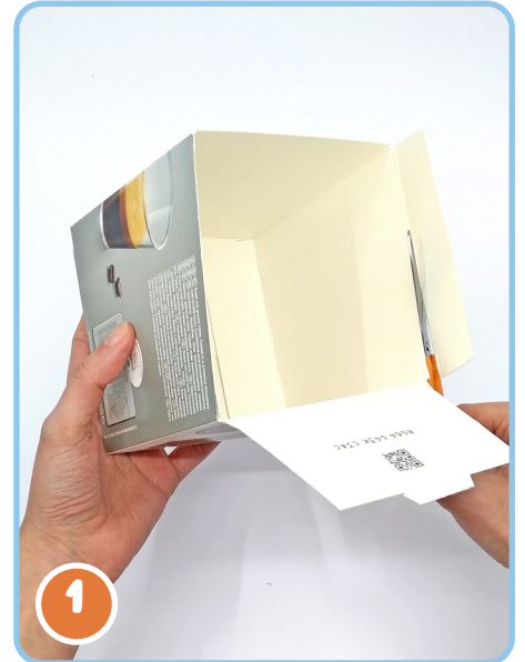
1. Carefully cut the lid and side flaps off the box.