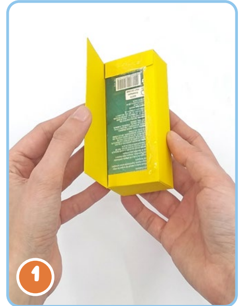
1. Start by wrapping the small box with yellow paper.