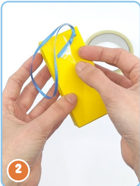
2. Loop a piece of ribbon and attach the ends to the back of the box with sticky tape.