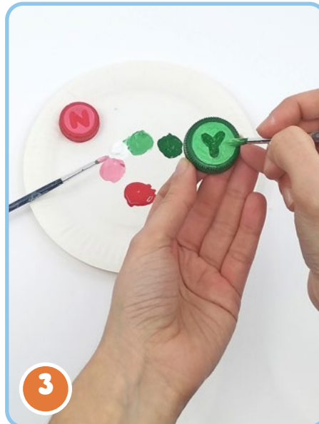
3. Paint the bottle tops, one green and one red. Finish by painting a "Y" on top of the green button and a "N" on top of the red button. Let them dry.